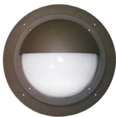
Trim Ring, Die Cast Aluminum, 1 9/16" Outer Diameter, Allows Recessed Mounting of Fixture, Textured Bronze Finish