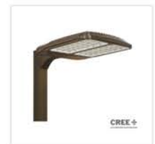
A Area Lighting