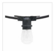
FESTOON Deco Lighting