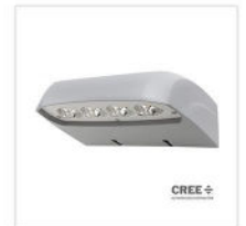
WP Wall Packs