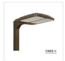
A-HO Area Lighting