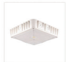
CPP Canopy Lighting