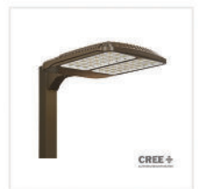
A Area Lighting