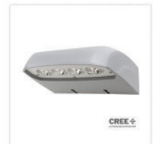
WP Wall Packs