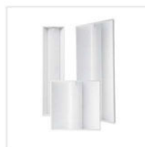
LG 2X4 Interior Troffer