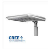
EHO Area Lighting